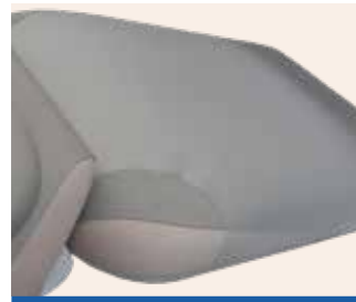
Leg section cover