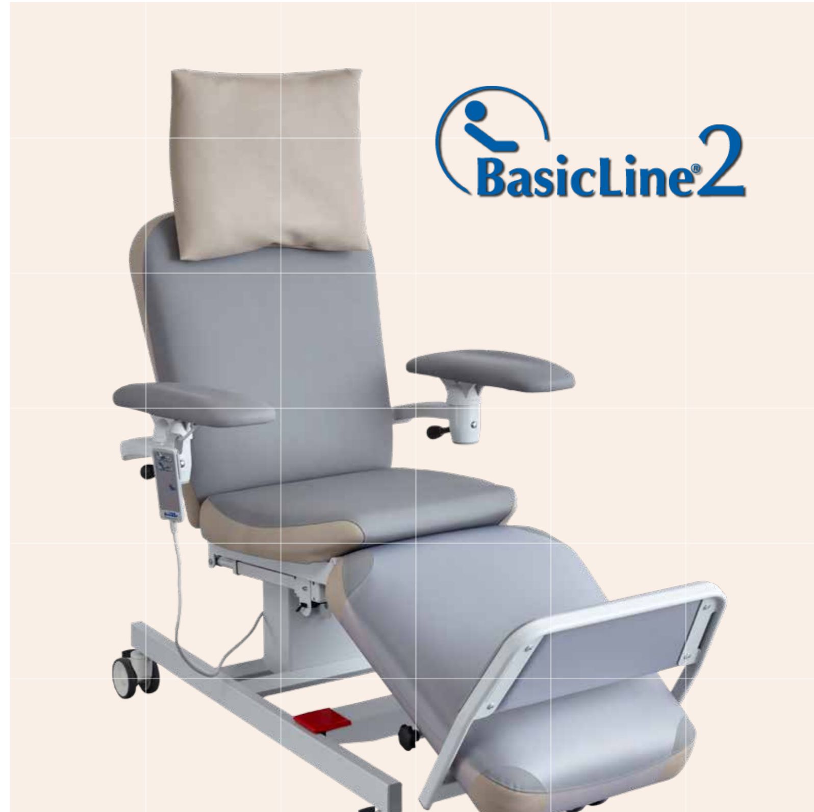
Picture contains optional accessories