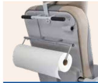
Paper roll holder