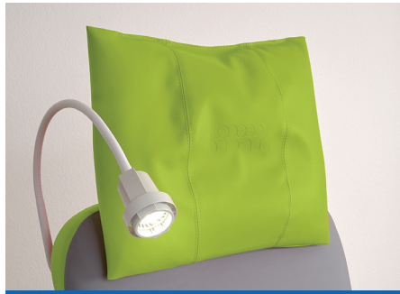
The comfortable pillow can be individually adjusted in height with a star screw.