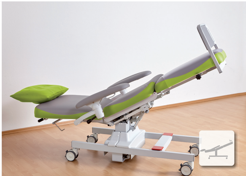
Fast shock position in case of emergency

The new UniversalLine2 is ideal for outpatient care of your patients.