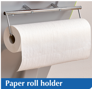
Paper roll holder