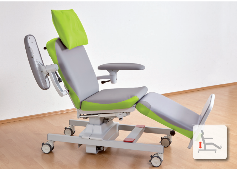
Pre-programmed seating position for entry and exit