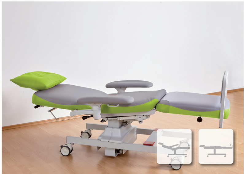
Optimal, individual relaxation through individually adjustable segments