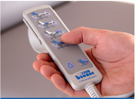
The illuminated hand control has a clear design and allows easy adjustment of the individual segments.