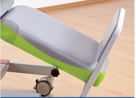
The manually adjustable footrest gives both small and large patients a safe feeling during treatment.