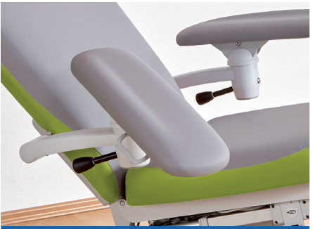
The armrest is swivelled to the side intuitively and simply with the aid of the lever, and can be lowered forwards for optimum positioning.

The colour of the therapy chair can be adapted to the furnishing of your ward thanks to the many different colours and the chic bi-colour design. In addition to the colour samples on the right, other colours are also available. Please contact us for the extensive colour chart.