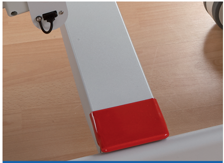
The large red footswitch allows quick adjustment of the shock position from both sides - the nursing staff's hands remain free for the patient.