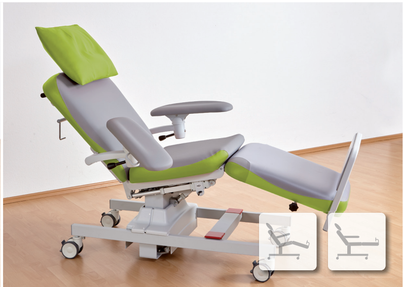
Quick adjustment of armrests