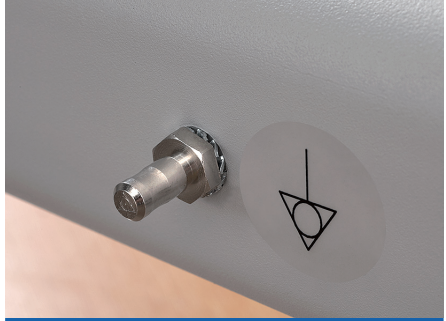
Equipotential bonding according to EN 60601 increases safety for your patients.