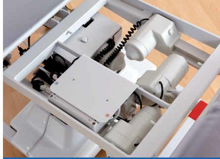
The four motors are positioned directly under the removable seat for easy servicing.