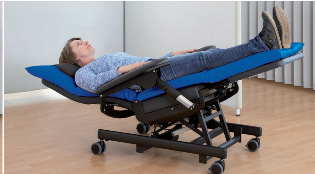
In case of an emergency the SlimLine can be moved into a lowered head position for cardio pulmonary rescue by pushing a button. Although the base frame is small and space-saving it offers perfect stability.

The SlimLine Therapy Chair has been developed for the needs in your oncology clinic and the infusion therapies.