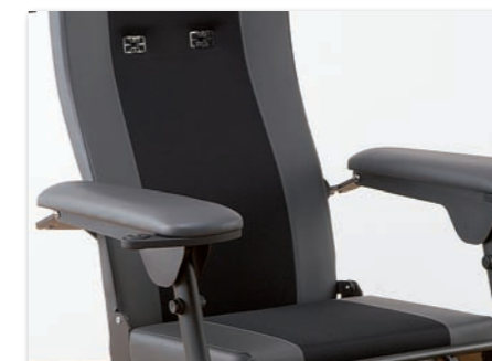
The unique base upholstery consists of an ergonomically shaped back segment and a flexible seat segment.