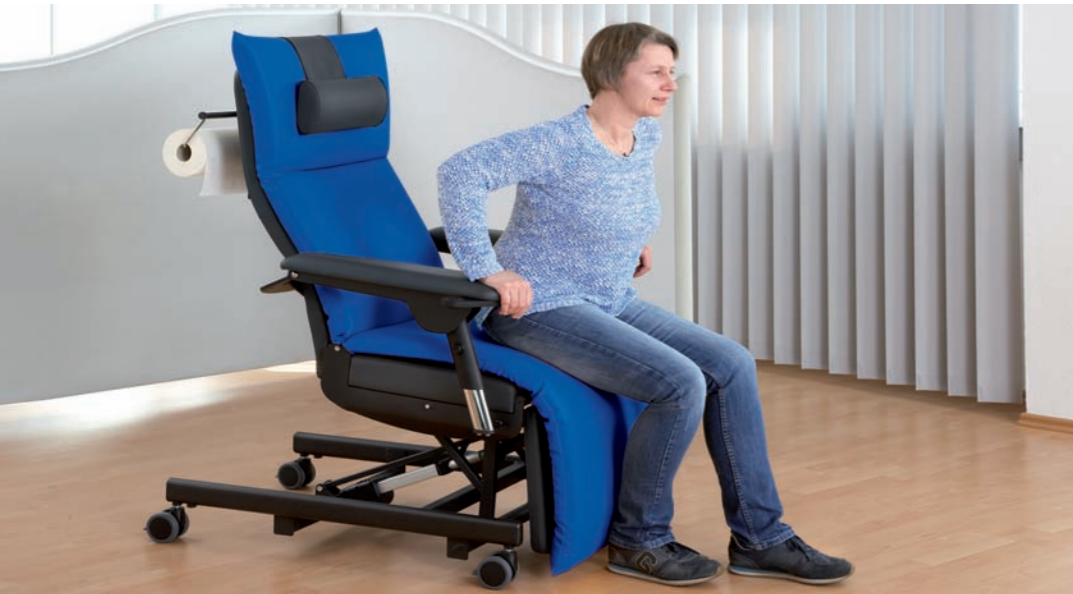
Easy entrance and exit from the chair's front is possible due to the low seat height of only 57,5 cm, the adjustable right angled leg segment and the perfect seat inclination.