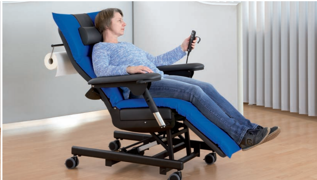
The SlimLine Therapy Chair has been especially developed for the infusion therapies and can be adjusted with two motors into a convenient comfort position fast and easily.