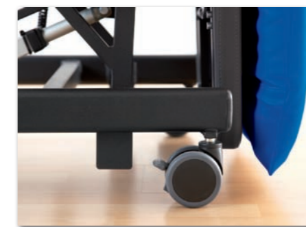
More flexibility: The SlimLine is equipped with wheels (7.5 cm ø) with single brake.