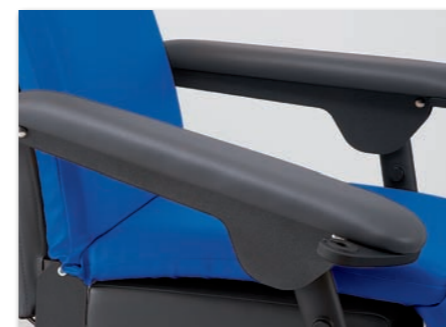
The stable armrests can be lowered by pushing a button and therefore adjusted to the needs of your patients.