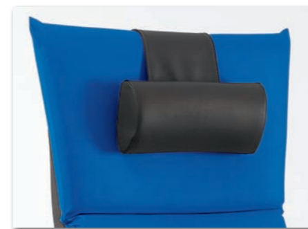
The neck pillow offers higher comfort and can be adjusted individually with a counterbalance.

To fit to your environment the colour of the SlimLine mattress can be chosen from more than 30 different colours. The base frame, the armrests and the optional neck pillow are always effected in Anthrazit.