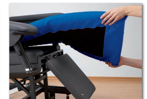
The removable and easy to clean mattress offers in combination with the base upholstery long-lasting comfort.